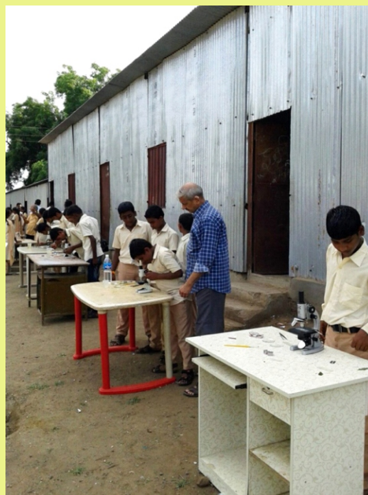
▲ Outdoor Biology Experiment