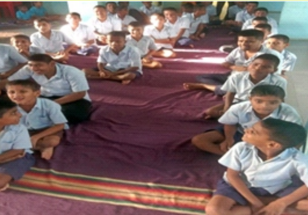
▲ Special Need Student Class