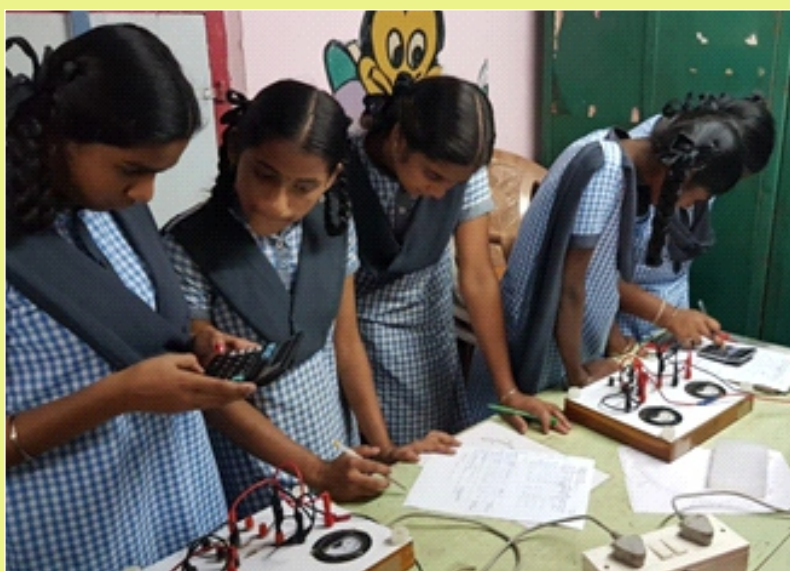
Physics Experiment ▶