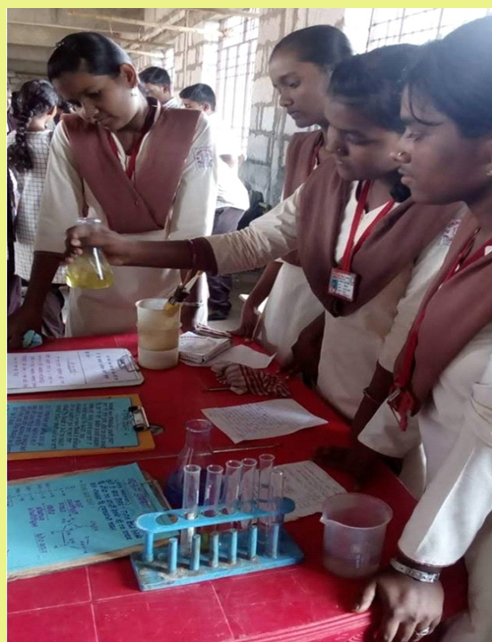
▲ Chemistry Experiment