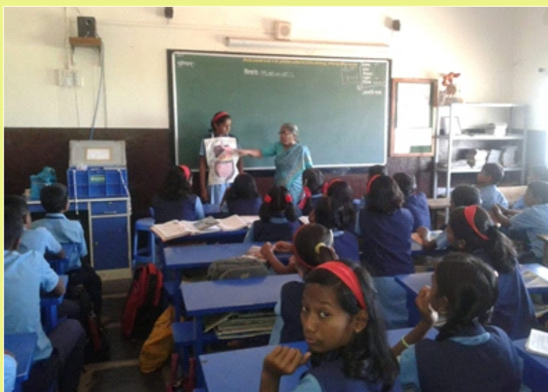
◀ Biology Class