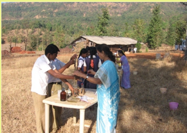
◀ Chemistry experiment