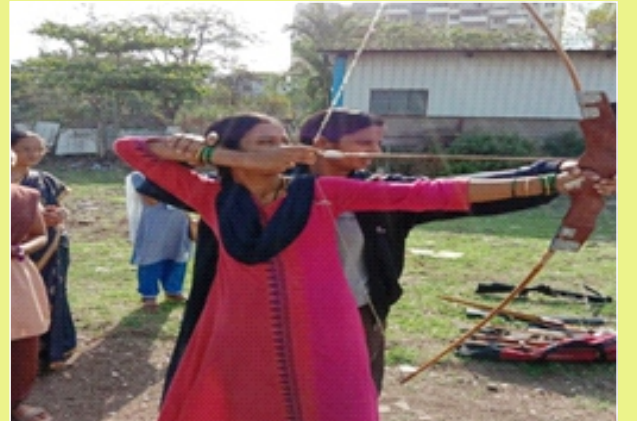
▲ Vv Shibir : Archery Class