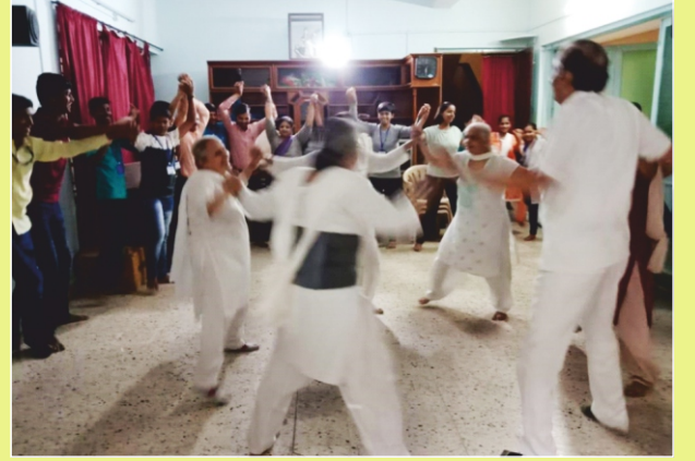
▲ Vidnyanvahini Shibir : Daily Morning Exercise ▲